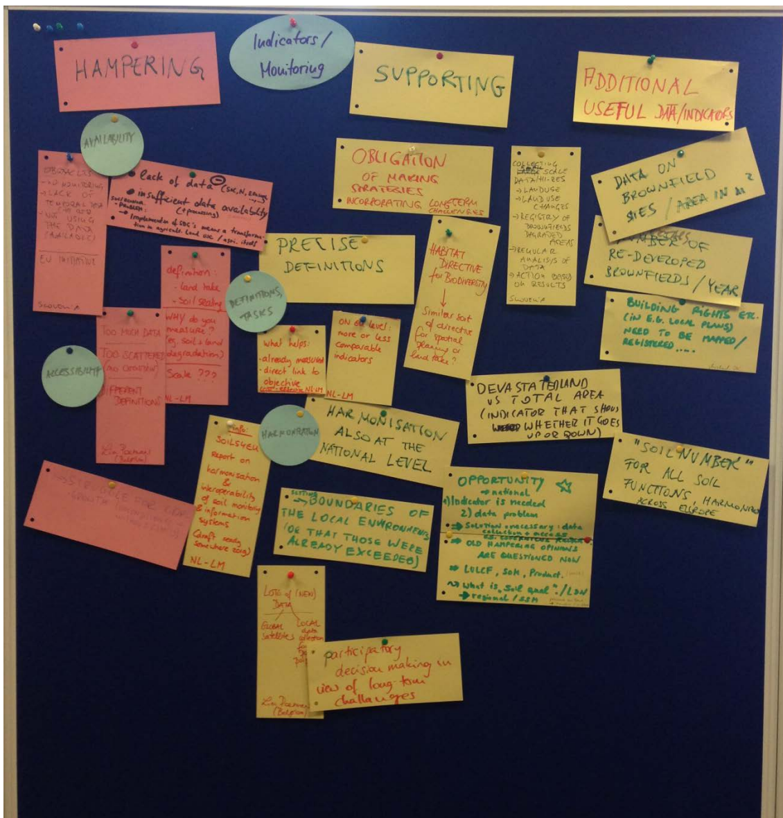
Figure 2: Results from the breakout group "Monitoring & Indicators"

As mentioned above, the situation with regard to land take monitoring and indicator use is very heterogeneous across Europe. This was again confirmed by the contributions of the participants during the two rounds of breakout group discussions.