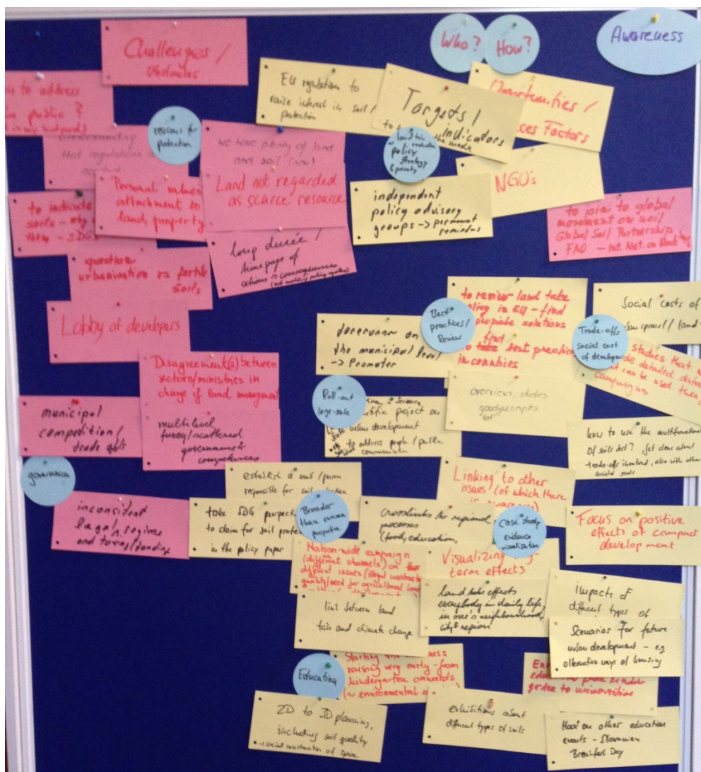
Figure 1: Results from the breakout group "Awareness Raising"

A shared perception of participants was that the challenge of land take and the resulting impacts are not commonly understood and recognized by the relevant actors. Although in some countries, political goals on reducing land take are anchored in sustainability strategies, process toward such objectives is hampered by a lack of political will to take (political) action or by weak implementation and enforcement of existing regulations. In other countries, land take is not a political issue as the need for protecting land and soils is not recognized by the general public and the interest in economic development is much more pronounced in the public debate. Against this background, participants stressed the need for land take entering the national political agendas and for support of this process, e.g. via European activities (e.g. Soil Framework Directive) that may foster also the establishment of national land take targets. Concentrating soil and land related competencies within one ministry / agency, convening an independent advisory council on land take and soil protection or supporting NGOs in taking a stand against land take and urban sprawl were further suggestions brought up by the participants.